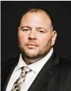
LOU ESPOSITO DEFENSIVE LINE FIELD